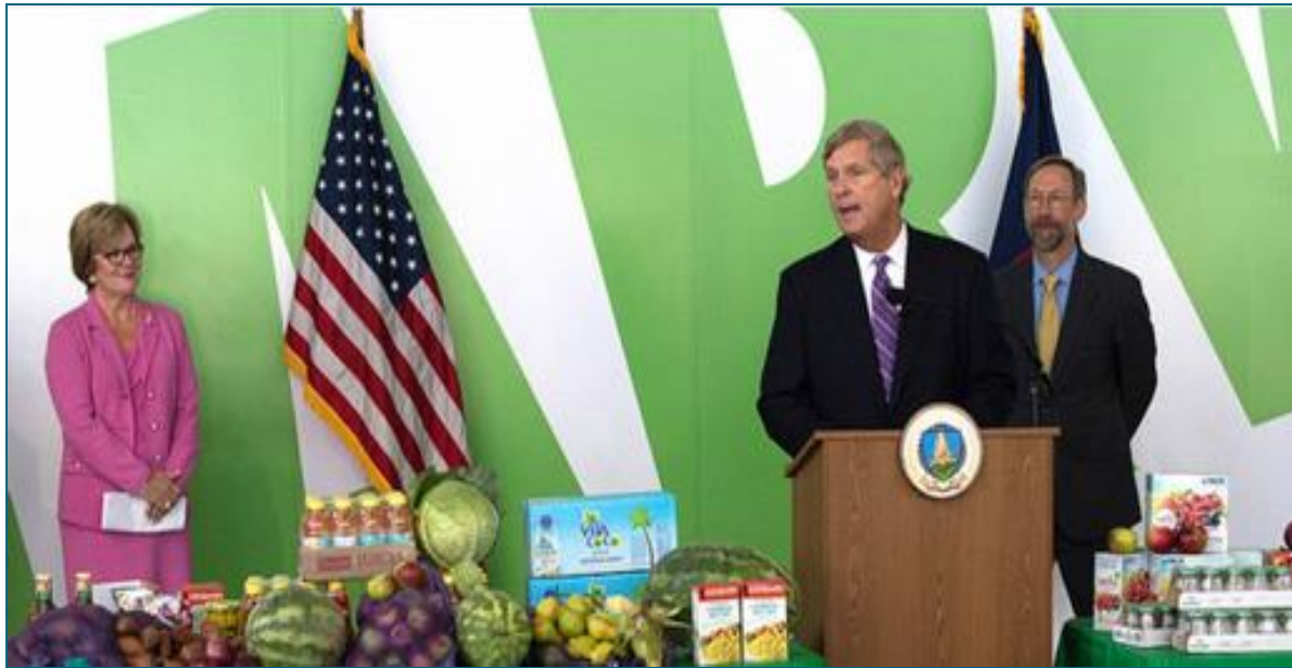
USDA Secretary Vilsack Announces U.S. Goal, 2015

On September 16, 2015, US EPA Deputy Administrator Meiburg and USDA Secretary Vilsack announced the United States' first-ever national food loss and waste reduction goal: to reduce food loss and waste by 50% by 2030