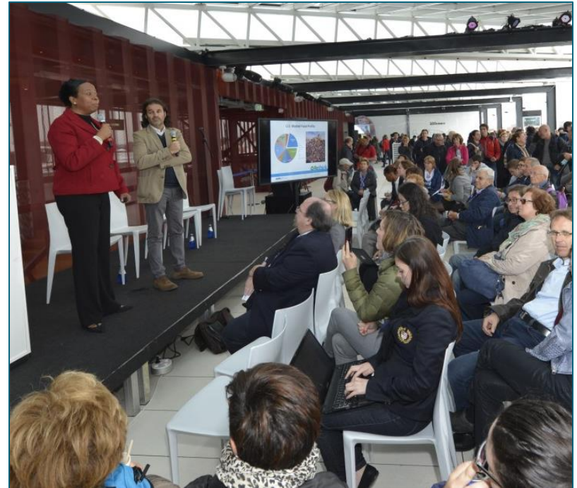
EPA Talk on Food Waste at EXPO Milano, 2015